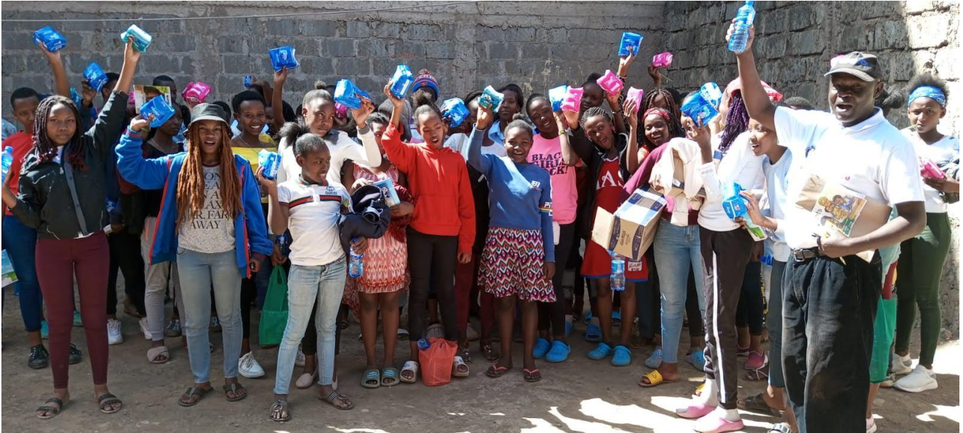
Distribution of sanitary towels to vulnerable girls in the community