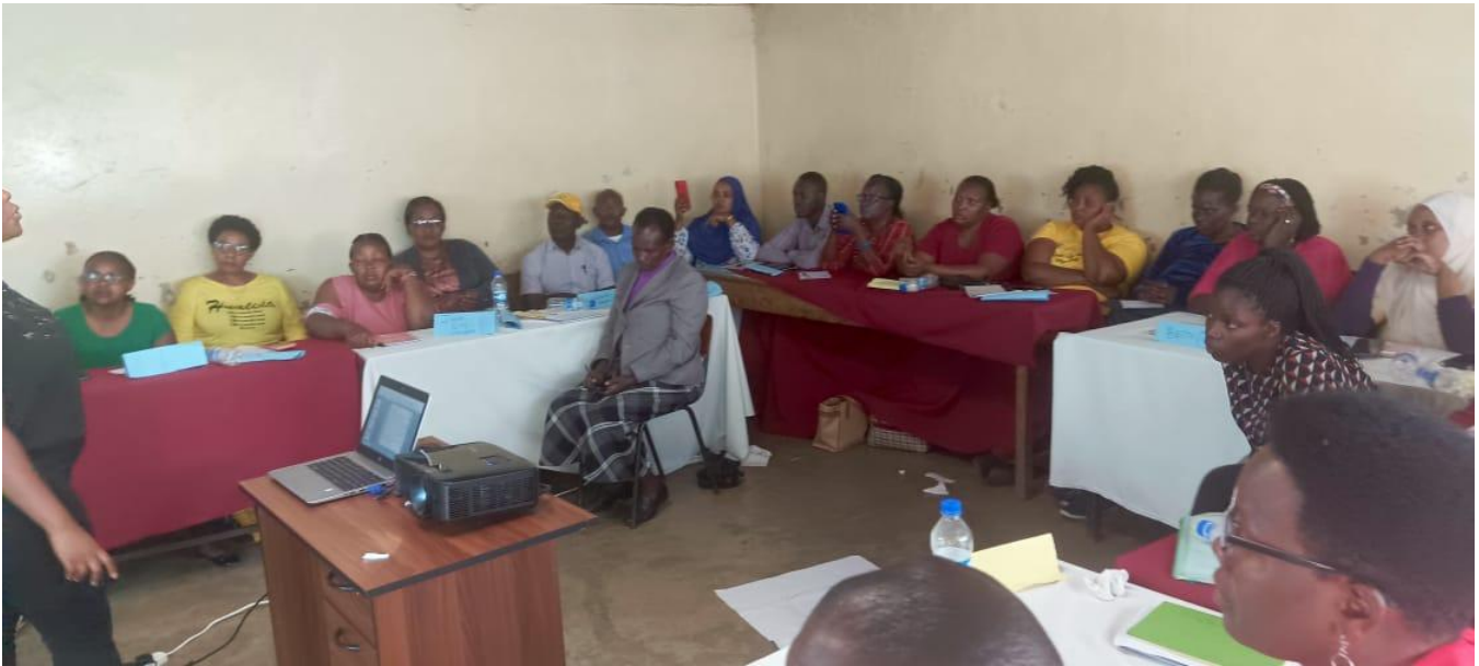
Women being trained under women empowerment program