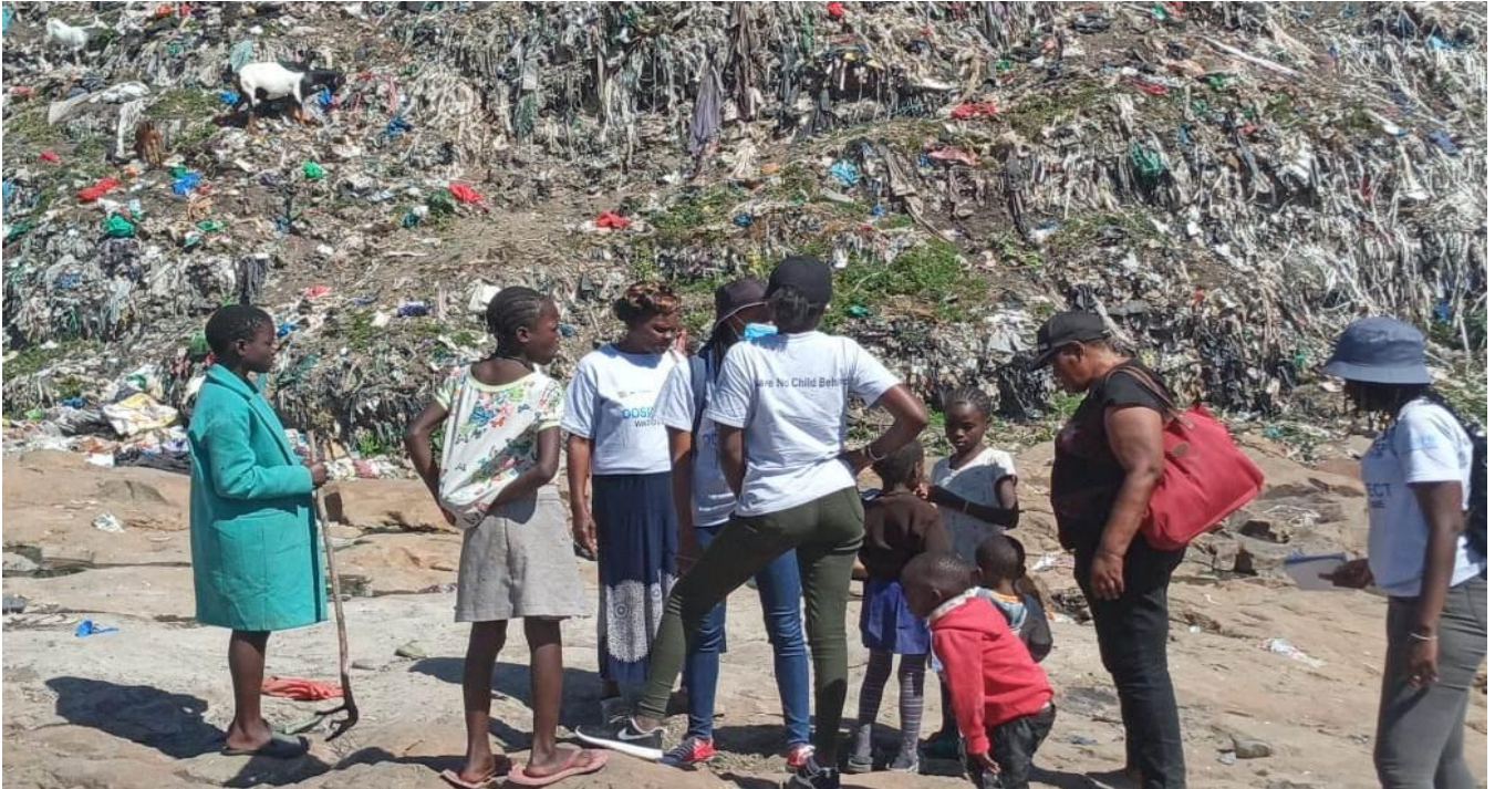
Lifeguard team carrying out identification of children needing rescue process in Dumpsites within Embakasi and Njiru District- photo Dandora Dumpsite