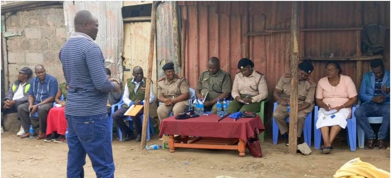
Lifeguard Kenya representatives engaging local administration and leaders on addressing community issues affecting children and women in Embakasi central area

Legal advocacy is also conducted within the paralegal program. Lifeskills addresses legal matters especially on children custody and maintenance. Advocacy activities are carried out through advocacy forums targeting the community. The advocacy agenda are also shared through community sensitization activities, children life challenge forums, family groups among other platforms. This has enabled addressing custody and maintenance challenges facing affected children in the area of operation.