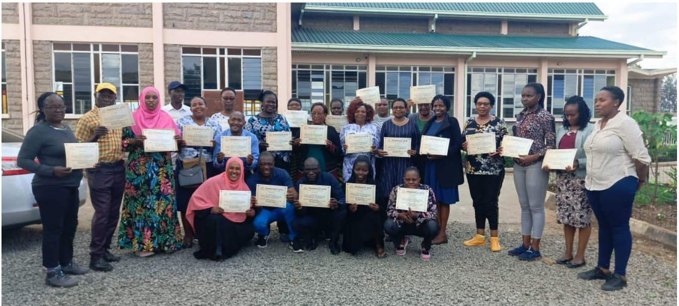
Lifeguard Kenya beneficiaries and teal receive certificate awards after completion of training sessions.

The organization provides training opportunities to selected women in tailoring and computer services. They are also engaged in training on entrepreneurship and business management. This has enabled the women in the area to be empowered economically and able to improve their livelihoods and support their families.