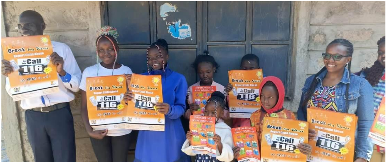
Children and youth engaged during the 116 Child help line campaign

whose aim is to educate children on life skills; create a platform for children to discuss issues affecting them; educate children on their rights and safeguarding; create an avenue for identifying risks and challenges faced by children; and equipping children with the skills and knowledge to address issues affected them within the community.