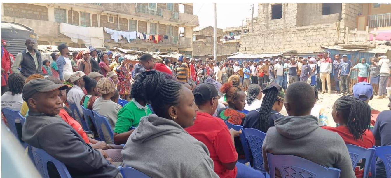
Community engagement forum on matters affecting the community especially on child protection and child rights especially to education and other basic needs

Victims of GBV are provided with mentorship and counseling services by Lifeguard Kenya counselors. Further the counselors also provide mediation in order to foster reconciliation among partners engaged in the violence. Lifeguard Kenya adapts a client centered approach where both non directive and eclectic counseling technique are deployed to help the beneficiary craft their own solutions and develop coping capacity that are sustainable.