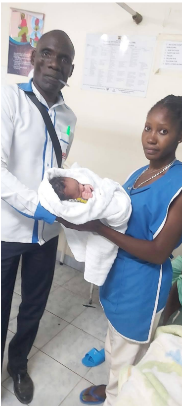
Lifeguard Team rescuing an abandoned child after birth at a local hospital in Kayole, Embakasi