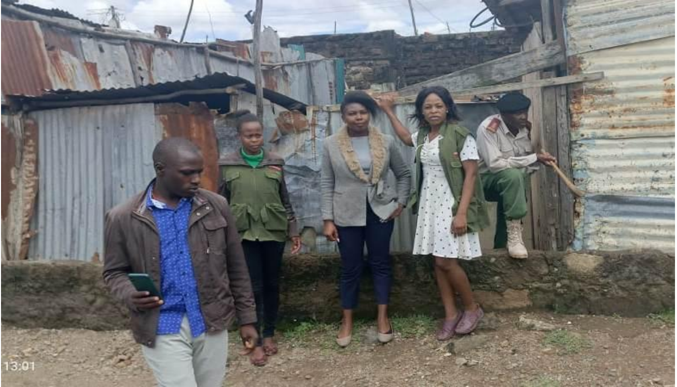
Lifeguard Kenya team with the local chief inspecting households' cases and situation following flooding.