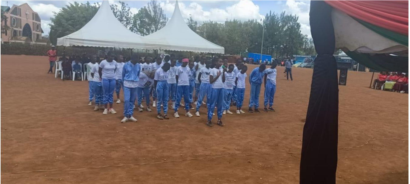
Children life challenge club members performing during community sensitization forum